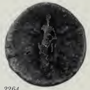
Lot No. 2264

Sestertius. Rv. Providentia standing l. RIC 22 (R2). Porous surfaces and hairline flan crack. Fine/Good. (300-400)